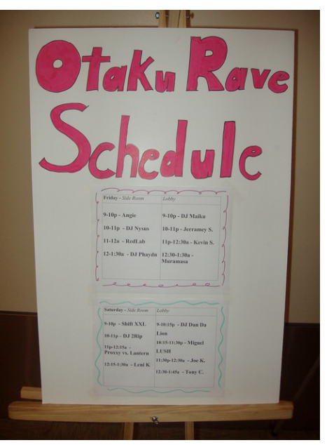
Every Rave needs a schedule.

That night there was a rave party which provided an interesting end to our night. We were treated to dancing geeks, glow sticks and break dancers who put everyone else to shame. Break dancers rule, hands down. We left our fond childhood memories behind and returned to our hotel room to get drunk and play video games.