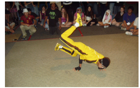
A break dancer gets his groove on at the rave party.