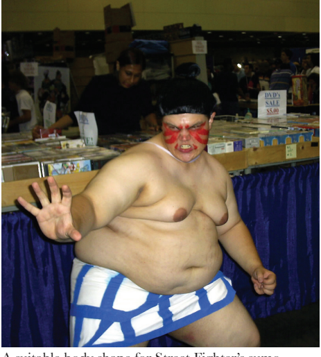
A suitable body shape for Street Fighter's sumo wrestler, E. Honda.