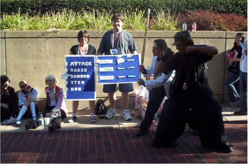
The Final Fantasy fight menu never fails to gather willing fighters.