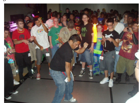
Dance little puppets, dance!