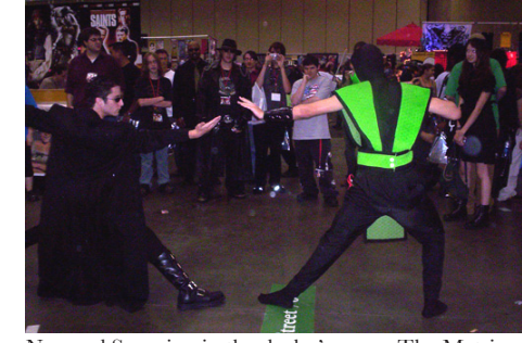
Neo and Scorpion in the dealer's room. The Matrix beats Mortal Kombat any day.

We didn't have to travel far before finding some interesting suckers, er, we mean subjects to photograph. Everything and everyone from Street Fighter to BLEACH were on display. It was a video gaming/Japanphile/social outcast's dream gathering which took over Baltimore's Inner Harbor for four days. Were there lots of confused residents? Yes and we shamelessly (cosplaying as well) enjoyed every moment of it. We spent time in the dealers' room thumbing through DVDs, import games, and graphic novels to our heart's content. Occasionally we actually brought stuff too! Amazing.