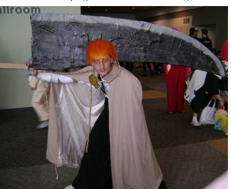
Anime characters with huge swords must be compensating for something.

We didn't have to travel far before finding some interesting suckers, er, we mean subjects to photograph. Everything and everyone from Street Fighter to BLEACH were on display. It was a video gaming/Japanphile/social outcast's dream gathering which took over Baltimore's Inner Harbor for four days. Were there lots of confused residents? Yes and we shamelessly (cosplaying as well) enjoyed every moment of it. We spent time in the dealers' room thumbing through DVDs, import games, and graphic novels to our heart's content. Occasionally we actually brought stuff too! Amazing.